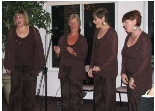
Elm City Echoes at Anniversary Dinner