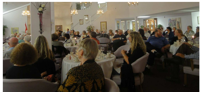
At the Anniversary Dinner