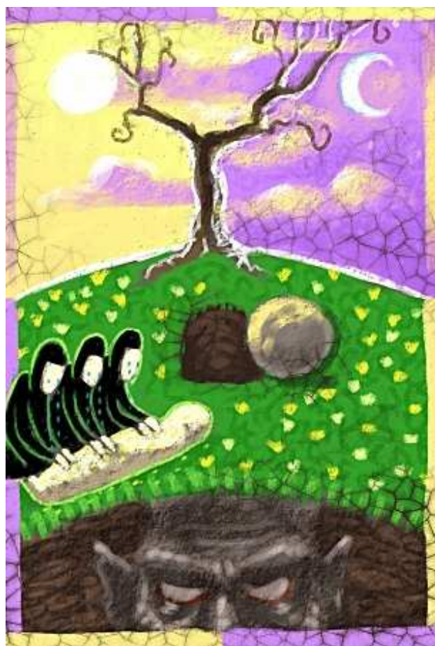
A Blessed Ostara to our Pagan friends